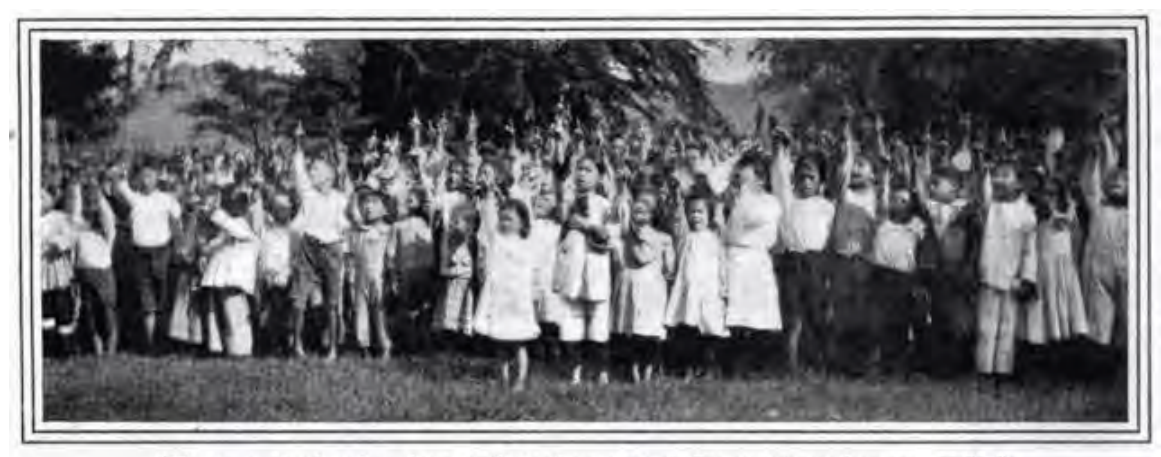
"We give our heads and our hearts to God and our country! One country, one language, one flag!" THIS SCENE SHOWS THE SALUTE TO THE AMERICAN FLAG WHICH FLIES IN THE GROUNDS OF THE KAIUALANI PUBLIC SCHOOL WHICH HAS MANY JAPANESE PUPILS. THE DRILL IS CONSTANTLY HELD AS A MEANS OF INCULCATING PATRIOTISM IN THE HEARTS OF THE CHILDREN

Under customary international law, Americanization is a war crime of attempting to denationalize the inhabitants of an occupied territory. Germans and Italians were prosecuted for the same war crime after World War II for implementing a systematic plan of Germanization and Italianization in occupied territories. According to the Nuremburg Indictment of Nazis.